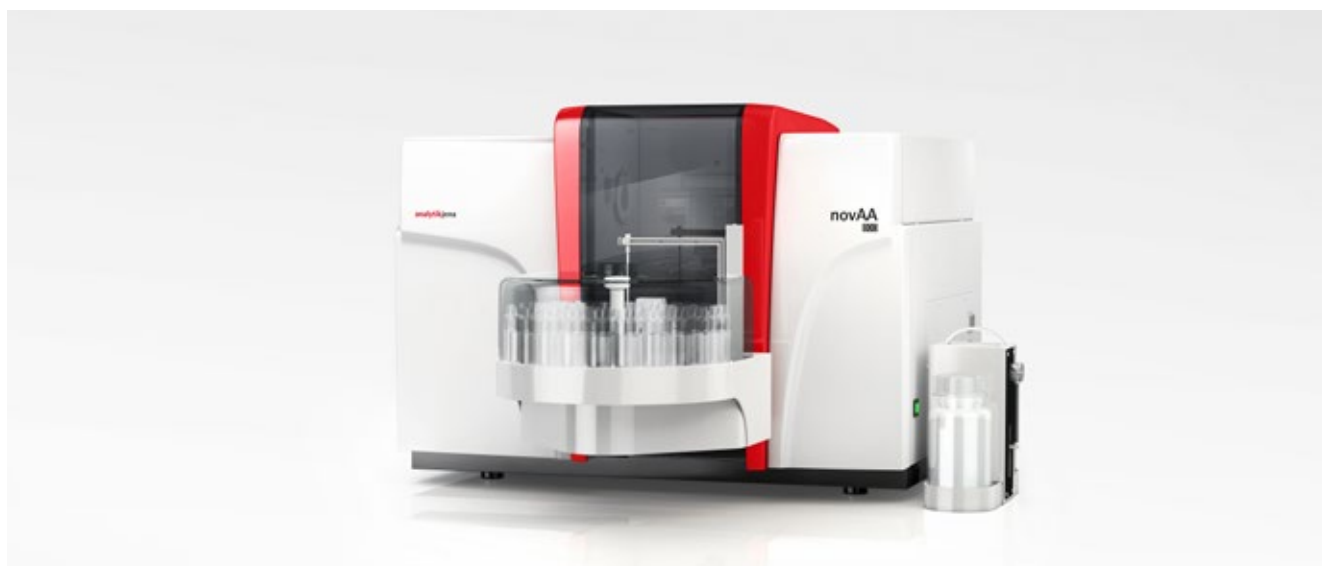
novAA® 800 F with autosampler AS FD for flame technique