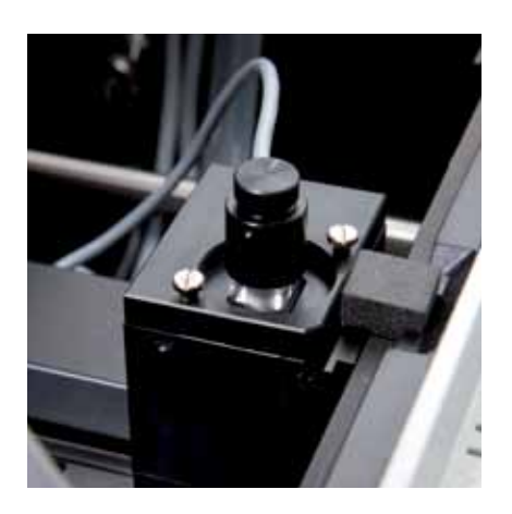
The peltier temperature controlled cell holder guarantees high temperature accuracies; the temperature is measured directly in the cell.

The possibility to implement two 8-cell changers enables a high number of flow-through cells can be integrated in the process.