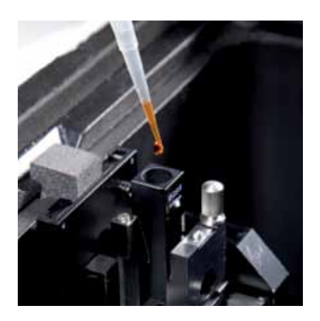
Adjustable cell holder with ultra-micro cell for precise quantitative analysis of extremely small sample volumes