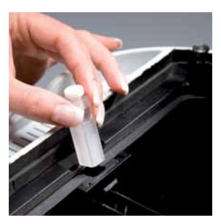
Position for turbid samples for measuring highly scattering samples