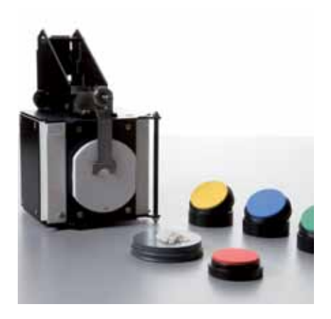
Integrating sphere for transmittance and diffuse reflectance measurements