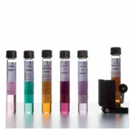
Ready-to-use test kits for water analysis

With the help of a measuring probe, less degradable organic compounds can be analyzed directly in the sample. The chemical oxygen demand (COD), ammonium, cyanide or elements such as lead, cadmium, nickel and aluminum in water samples can be detected quickly and easily using ready-to-use test kits and the round cell holder. The dedicated position for turbid samples of the SPECORD® PLUS allows reliable measurements of highly scattering samples, such as turbid waste water.