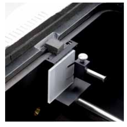
Solid sample holder to determine transmission characteristics