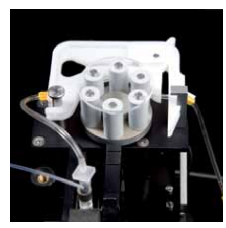
Sipper system for routine quantitative analysis