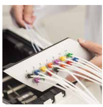
The SPECORD® PLUS Dissolution can be used to examine the release of active ingredients in tablets during the dissolution process.