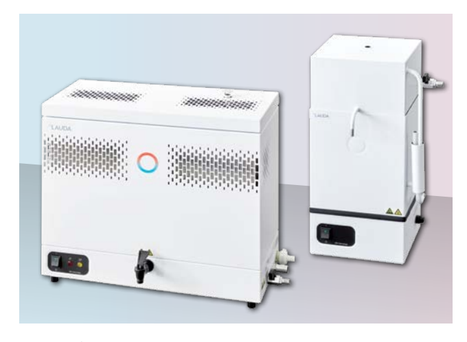
Equipped for any application: Puridest PD 4\ R with an internal storage tank and PD 2 for direct distillate extraction

Commissioning and operation of the stills are extremely simple. Ultra-pure water can be extracted directly after connection to the raw water and power supply. The only maintenance required is removing pollutants from the still. Dispensing with complex service work and cleaning as well as the repeated procurement of consumables makes LAUDA Puridest a simple and reliable solution that can be used anywhere in the world.