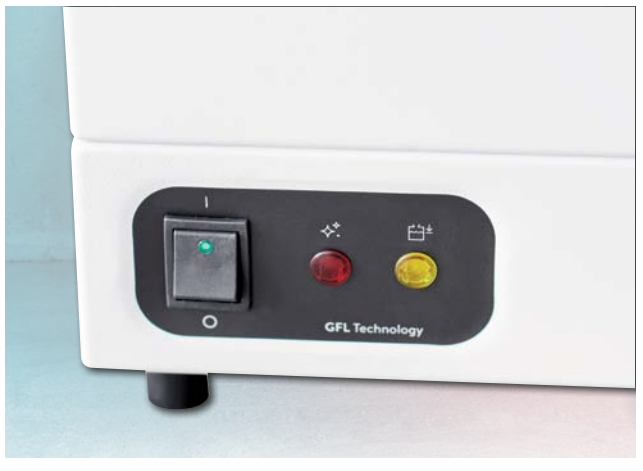
Our maxim is simplicity: LED indicators for operating status and cleaning requirement are equipped as standard