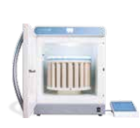
ETHOS UP High Performance Microwave Digestion System