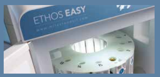
SUPERIOR EASE OF USE AND CONTROL