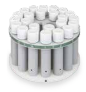
fastEX-24 Extraction rotor for environmental sample

The ETHOS EASY embraces Milestone's philosophy of a "microwave labstation". The ETHOS EASY platform is capable of several applications beyond microwave digestion. Extraction of pollutants from environmental samples can be done in just few minutes, consuming less solvent than other technologies, thereby improving productivity while decreasing costs, all in full accordance with the US EPA 3546. Additional accessories are available to further expand the ETHOS EASY capabilities: additional digestion rotors, inserts and micro-inserts to reduce blanks in the digestion processes, a dedicated configuration for total fat determination in food samples which greatly improves turn-around-time, and an ashing accessory which converts the digestion system into a microwave muffle.