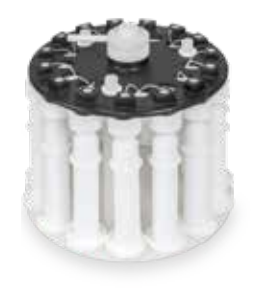
MMR-15 Evaporation/ Concentration rotor