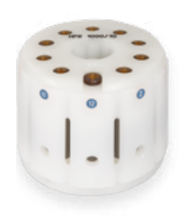
SK-10/12 High-pressure digestion rotor