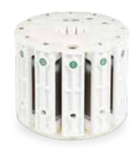
SR-12 Extraction rotor for total fat determination in food