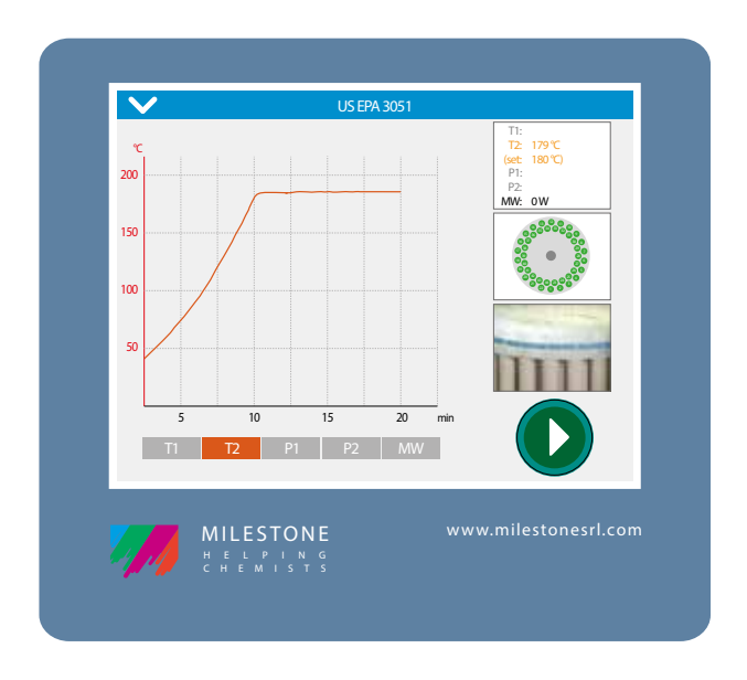
Temperature profile of a soil digestion in accordance with US EPA 3051 using the MAXI-44 rotor

The easyTEMP contactless sensor directly controls the temperature of all samples and solutions, providing accurate temperature feedback to ensure complete digestion in all vessels and high safety. This technology combines the fast and accurate reading of an in-situ temperature sensor with the flexibility of an infrared sensor. The temperature profile of the digestion process is displayed in real-time on the ETHOS EASY terminal.