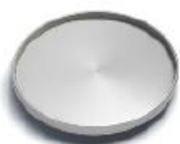
A0000323 MultiAluBlock™ Base accommodates up to 4 different MultiAluBlocks™