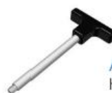
A0000351 Handle for AluBlock™ removal

The handle for AluBlock™ removal protects you from potential burnings when operating with hot MonoAluBlocks™.