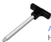
A00000351 Handle for AluBlock™ removal

The handle for AluBlock™ removal protects you from potential burnings when operating with hot MultiAluBlocks™.