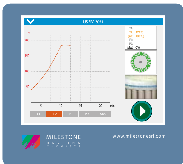
Temperature profile of a soil digestion in accordance with US EPA 3051 using the MAXI-44 rotor

The easyTEMP contactless sensor directly controls the temperature of all samples and solutions, providing accurate temperature feedback to ensure complete digestion in all vessels and high safety. This technology combines the fast and accurate reading of an in-situ temperature sensor with the flexibility of an infrared sensor. The temperature profile of the digestion process is displayed in real-time on the ETHOS EASY terminal.