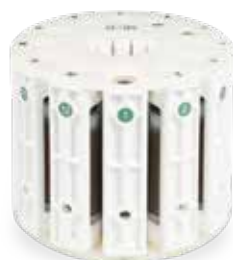
SR-12 Extraction rotor for total fat determination in food