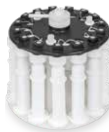
MMR-15 Evaporation/ Concentration rotor