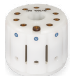
SK-10/12 High-pressure digestion rotor