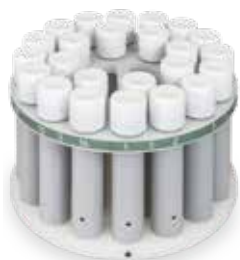
fastEX-24 Extraction rotor for environmental sample

The ETHOS EASY embraces Milestone's philosophy of a "microwave labstation". The ETHOS EASY platform is capable of several applications beyond microwave digestion. Extraction of pollutants from environmental samples can be done in just few minutes, consuming less solvent than other technologies, thereby improving productivity while decreasing costs, all in full accordance with the US EPA 3546. Additional accessories are available to further expand the ETHOS EASY capabilities: additional digestion rotors, inserts and micro-inserts to reduce blanks in the digestion processes, a dedicated configuration for total fat determination in food samples which greatly improves turn-around-time, and an ashing accessory which converts the digestion system into a microwave muffle.