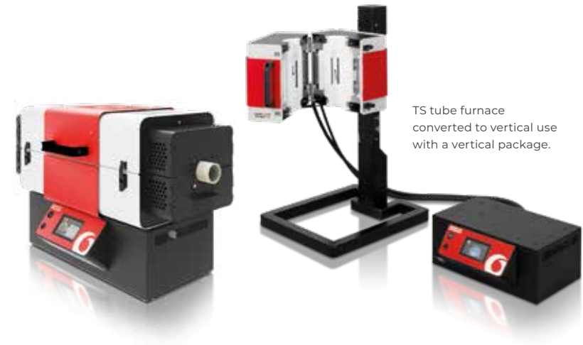
TS tube furnace converted to vertical use with a vertical package.

Most Carbolite Gero tube furnaces are supplied in a horizontal configuration as standard. Vertical packages are available to support the tube furnace and work tube in a vertical configuration.