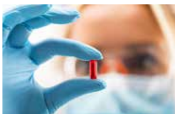
| Medical Device / Pharmaceuticals