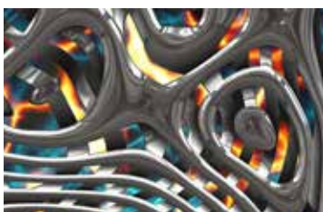
| Materials Research