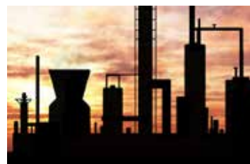
| Coal / Power plant / Energy