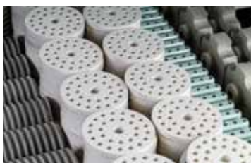
| Technical Ceramics