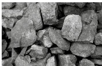
| Coal and coke testing