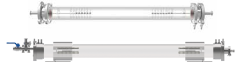
Examples of work tube packages

Each package comprises a work tube with insulation plugs or radiation shields appropriate for the operating atmosphere. End seals are included for the inert atmosphere and vacuum packages.