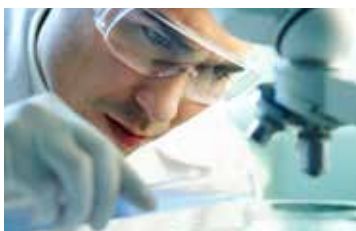
| Research / University