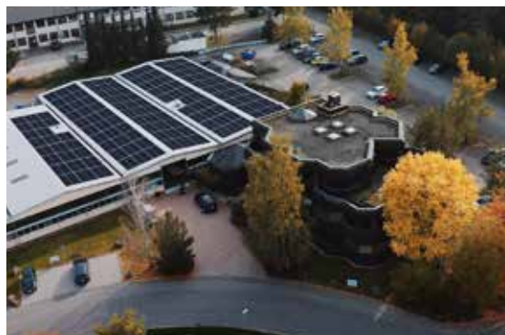
Carbolite Gero, Neuhausen/Germany

Throughout its history, Carbolite Gero has been at the forefront of technological advancement, consultancy, and customer service. With ambitious growth objectives set for the future, Carbolite Gero continues to build on its legacy of innovation and excellence.