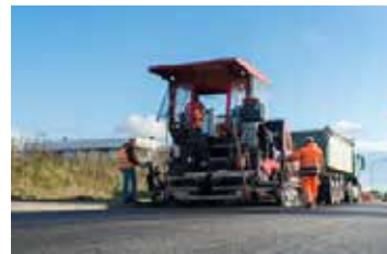
| Asphalt Binder Analysis