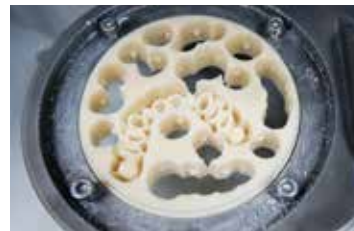
| Ceramics / Glass