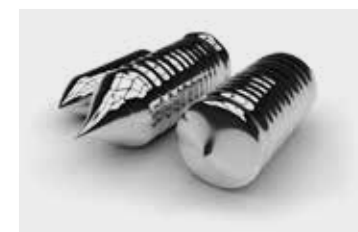
| Crystal Growth