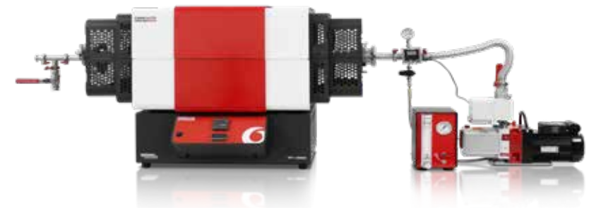
TF tube furnace combined with the Rotary vane pump package and vacuum work tub package

Combining a vacuum pump package with a work tube vacuum package offers a complete solution for horizontal tube furnaces. Please contact Carbolite Gero for assistance.