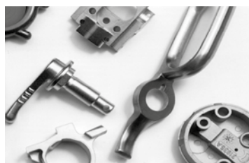
| Metal Injection Moulding (MIM)