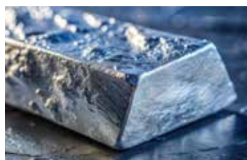
| Vacuum Soldering &amp; Brazing