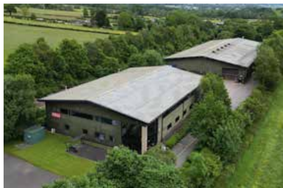
Carbolite Gero, Hope/United Kingdom