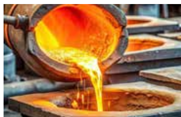
| Steel / Metallurgy