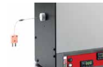
| Thermocouple Calibration