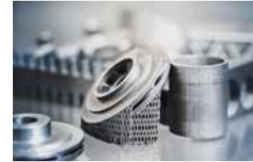
| Additive Manufacturing