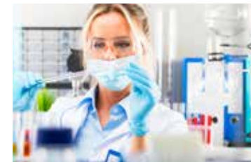
| Chemistry / Plastics