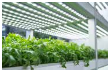
| Food / Feed